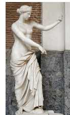
Museo archeologico Napoli