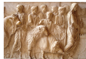
Sacrifice of pork, mutton, beef Musée du Louvre, Paris

Certain divinities from conquered countries are adopted by the Romans: