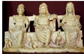
Museo archeologico Moncello