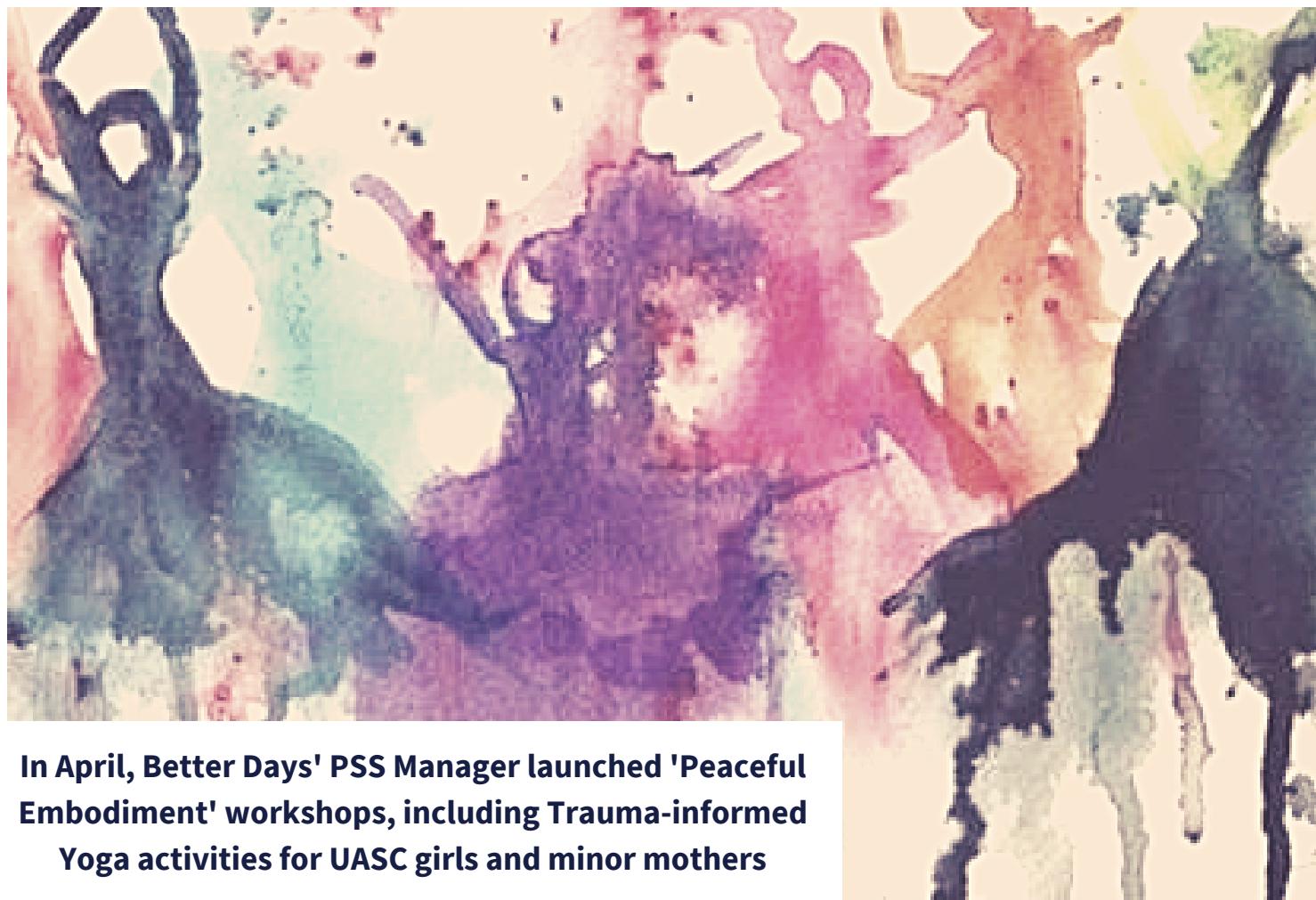
In April, Better Days' PSS Manager launched 'Peaceful Embodiment' workshops, including Trauma-informed Yoga activities for UASC girls and minor mothers